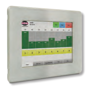
RHINO touch panel